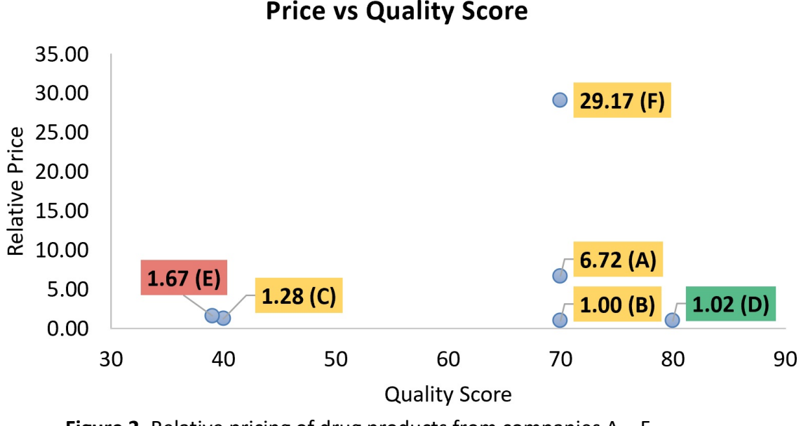
Figure 2. Relative pricing of drug products from companies A – F (denoted in parenthesis) plotted against their quality scores and given their respective red/yellow/green designation.

Although the decision tree in Figure 1 proposes the option of paying more for a higher scoring drug product, the pricing comparison illustrated above suggests that higher quality drug products do not necessarily cost more. Despite continued quality issues with valsartan, the least expensive option had the second-highest quality score, the highest quality score option was only 2% more expensive and the lowest scoring option was 67% more expensive.